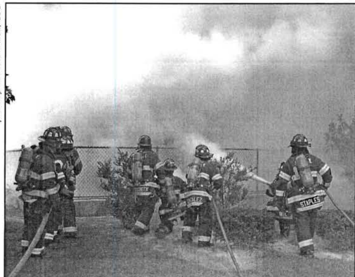
Engine companies protect exposures with hose-lines, preventing the fire from extending beyond the transformer.

All the while, units operated with all protective equipment